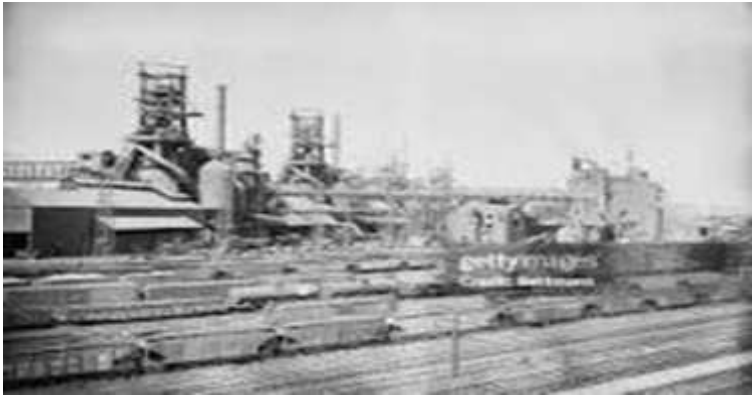
Youngstown Sheet & Tube Company